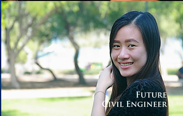
FUTURE CIVIL ENGINEER