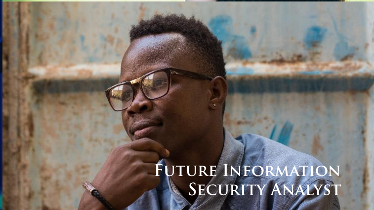
FUTURE INFORMATION SECURITY ANALYST